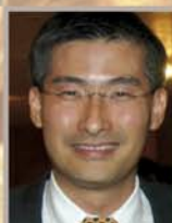
Raymond Woo Plasma and LCD TV RM 250k