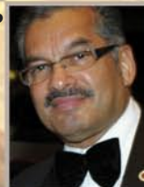
Aravind Pest Control RM80k