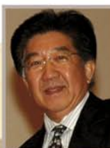
Sng KH Security Systems RM400k