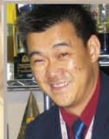
Chong BS Premium and Gifts RM1.5M