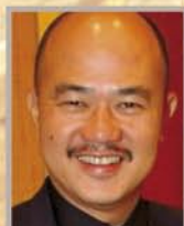
Song Caterer RM 200k